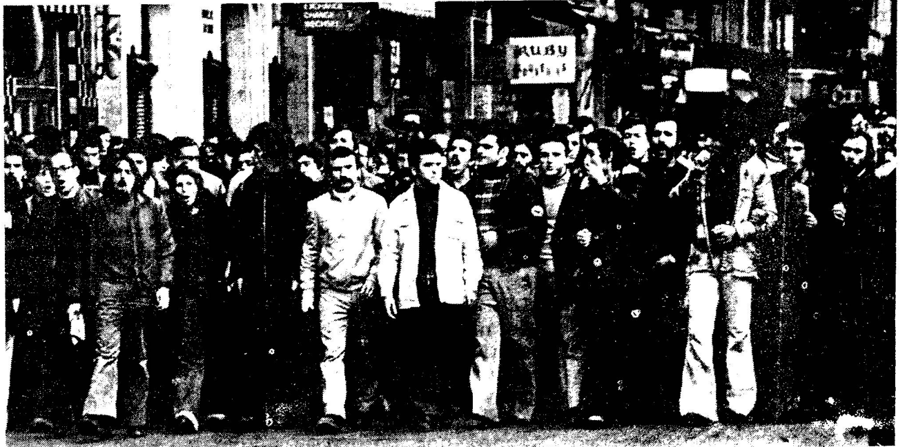
January 14, demonstration in Barcelona of SEAT and bank workers. In the first ranks one can recognize certain leaders of the PORE.

That is why the prisoners of the PORE brought to trial first--in order to frighten the workers movement, in order to do away with the militants before it is too late, in order to behead the movement. The regime is so eager to strike at the PORE that it brought the cases of its militants to trial out of the prescribed sequence. Militants of the PORE who are in other